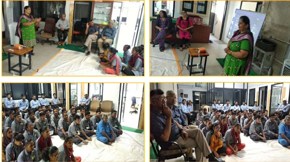
Parenting for Peace Workshop