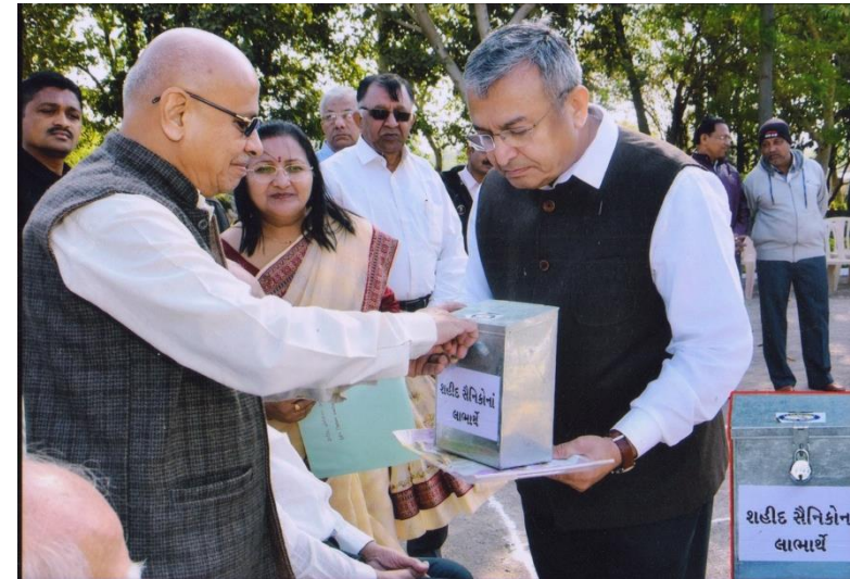
CSR Activity: Donation to the "Shahid Jawan Fund"