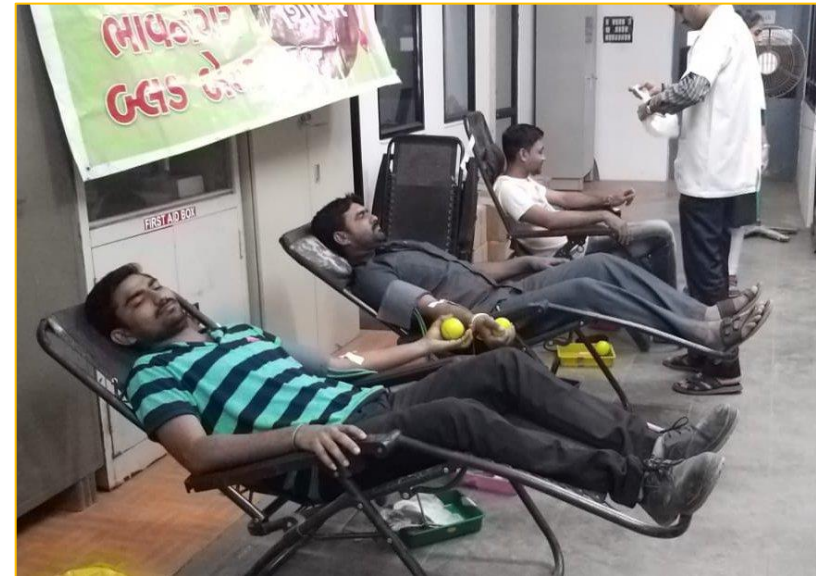
Blood Donation Camp 2019