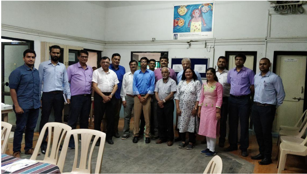
CII Delegation on Study Tour : HR Practices